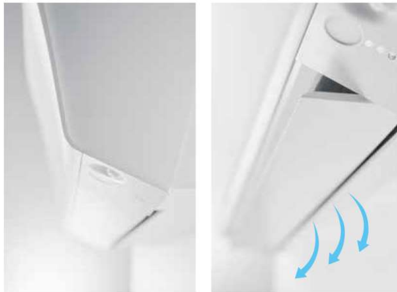
The side of the panel emphasises the strong airflow of the unit